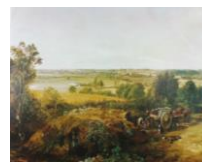
Stour Valley and Dedham village by Constable

Famous artists to paint landscapes were John Constable, Thomas Gainsborough and Claude Monet