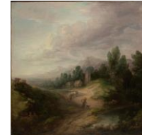
Wooded upland landscape by Gainsborough