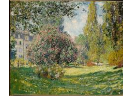
The Parc Monceau by Monet