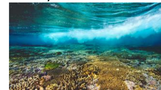
The Great Barrier Reef