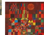
Castle and sun by Klee